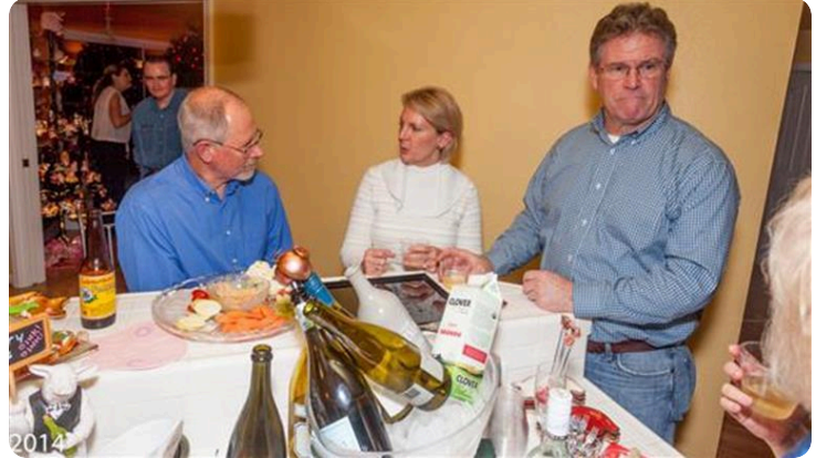
Pig Party 2015