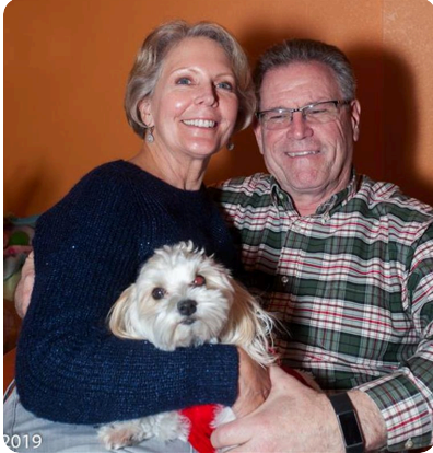
Pig Party 2019